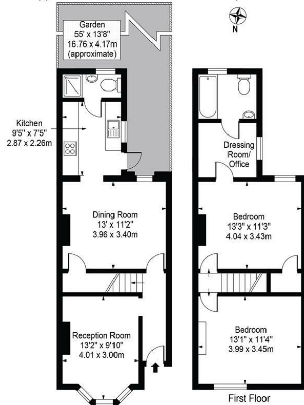
Ground Floor For Illustration Purposes Only - Not To Scale

Eastbrook Road, Waltham Abbey, EN9 3AL Approx. Gross Internal Area 895 Sq Ft - 83.15 Sq M